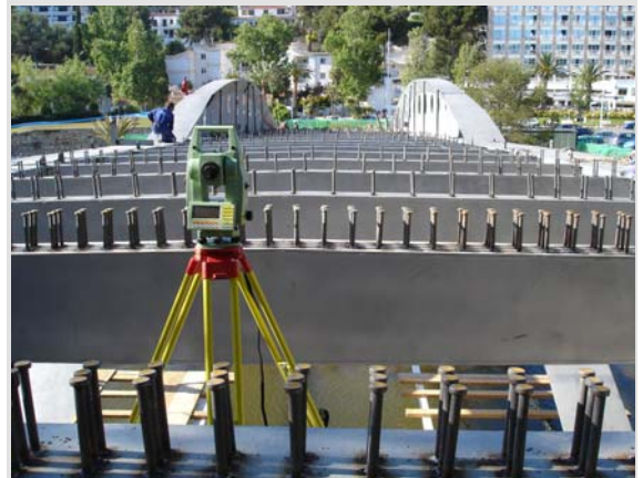
Figure 12: Shear connectors on transverse beams

Information for this case study was kindly provided by Pedelta.