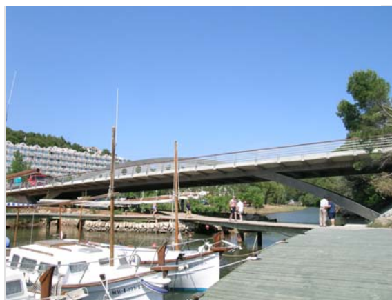
Figure 1: General view of the bridge