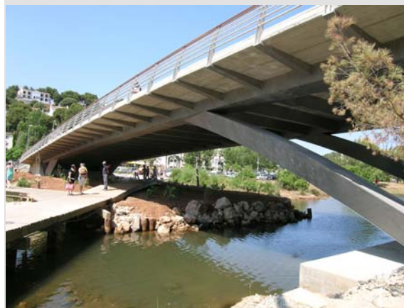
Figure 2: Arch-longitudinal beam connection