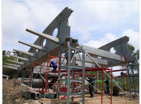
Figure 11: Temporary supports for the main structure

Erection: Starting with the demolition of the existing bridge, work on the new bridge began in October 2004 and was finished in June 2005. The main stainless steel structure was assembled on site from 8 sections; each section was lifted onto temporary supports to facilitate welding (Figure 11). Shear connectors were attached by manual welding (Figure 12). All welding was controlled using standard methods (visual inspection, X-ray, magnetic particles, etc).