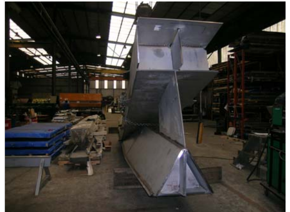
Figure 5: Cellular steel plate between the arch and longitudinal beam

The transverse beams, at 2 m spacings, are rectangular hollow sections 250 mm wide and 500–570 mm variable depth, which enables the deck to achieve a cross-slope of 2%. The thickness of the beam sections varies between 10 and 12 mm. These beams are connected to the longitudinal beams beneath and to the reinforced concrete slab above, which has an average thickness of 300 mm, by means of 20 mm diameter duplex stainless steel shear connectors.