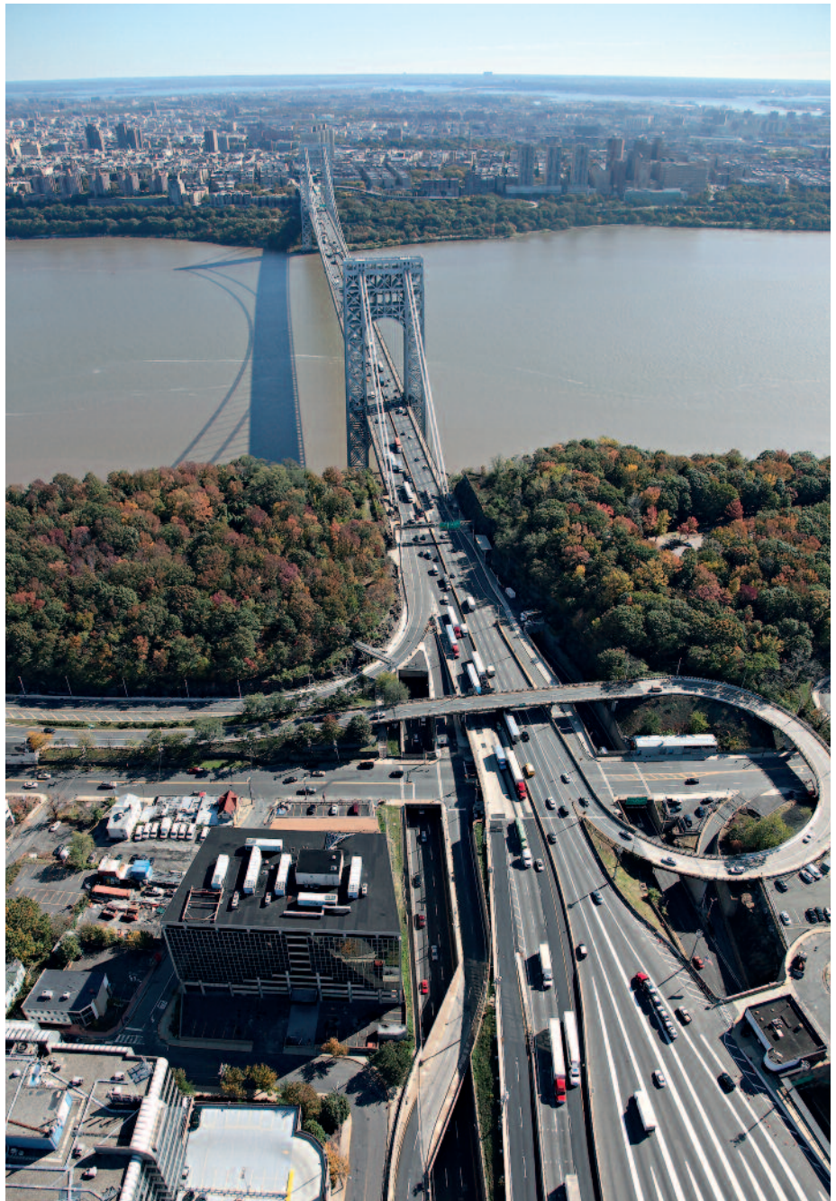
Even though the George Washington Bridge is nearly 90 years old, it adapted to increasing traffic by adding a second deck below the original one in the 1960s, and is now the busiest bridge in the world.

Although the harsh environment, age and traffic volume collectively pose a unique challenge in maintaining the George Washington Bridge, the use of stainless steel rebar ensures that it will be a long time before its deck has to be restored again. With the help of molybdenum-containing stainless steel, the George will provide a safe passage over the Hudson, with minimal disruption, for many generations to come. (FS, KW)