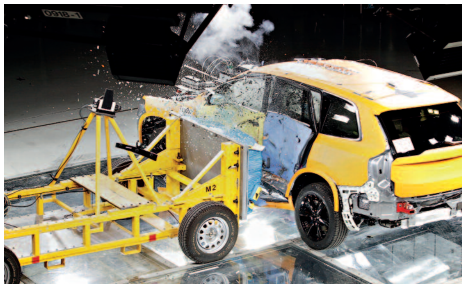
The side impact crash test reveals the behavior of a vehicle in this type of accident.

In the early 1980s, the Swedish company Hardtech developed a process that heats a steel sheet to around 900 °C prior to forming it into complex shapes. The cold forming die quickly absorbs the workpiece heat, quenching the formed part. Steel with the right chemical composition transforms during quenching into the extremely strong "martensite" phase, producing a workpiece with very high strength. The process is now known as press-hardening. Although it was well known that alloying steel with molybdenum promotes martensite transformation upon quenching, the original process used a very small alloy addition of boron instead. Accordingly, steel used for press-hardening is also widely known as "boron steel".