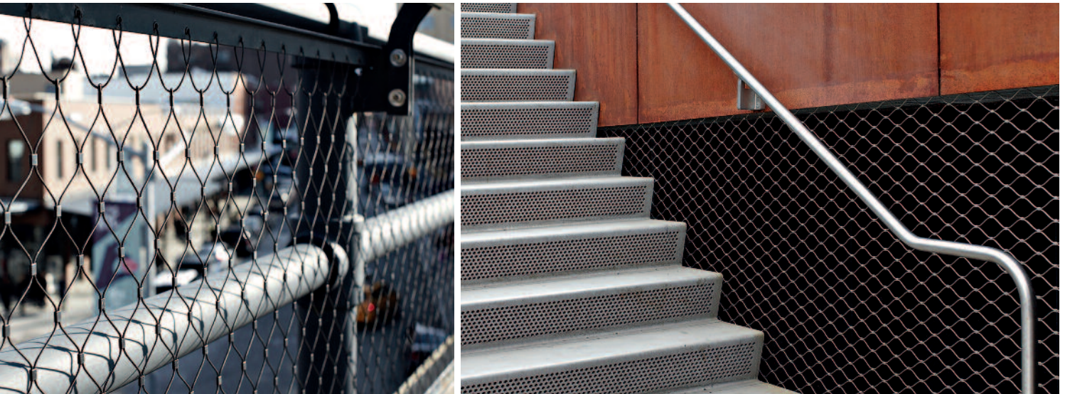
Stainless steel netting is very versatile. It ensures the safety of visitors and can also be visually adapted to the environment where it is installed. On the left it protects existing steel railings and has therefore been colored black to better blend in. On the right, where it is used on a newly installed stainless steel staircase, it has been left in its shiny state.

stainless steel minimizes the need for continued maintenance in such a high-traffic area and provides the durability required to stand up to millions of visitors annually. Molybdenum imparts excellent resistance to atmospheric corrosion, a problem for some metals in environments like New York City that are near the ocean or subject to deicing salts.