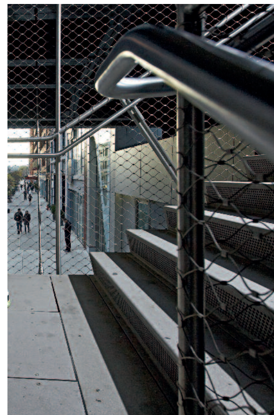
Type 316 stainless steel stairs, hand rails and netting are leading visitors up to the High Line in New York City.

and other goods, the railway became known as the “lifeline of New York”. After decades of national highway expansion, however, the High Line gradually became irrelevant in a trucking-dominated industry. Carrying just three cars of frozen turkey breasts, the final train made its way down the track in 1980 and the “lifeline of New York City” fell silent. In the absence of activity, its steel skeleton concealed itself among the grasses; rusted edges obscured a still-sound foundation.