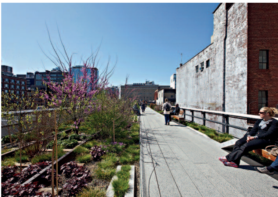
The park invites visitors to relax and take in the views of the city and nature.