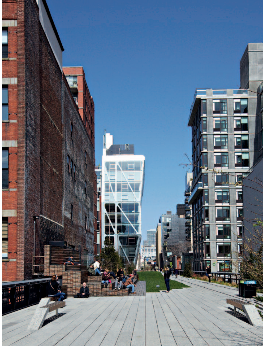
The elevated High Line park is embedded in the neighborhood. Some stretches are flanked by buildings on either side and new ones are added every year.