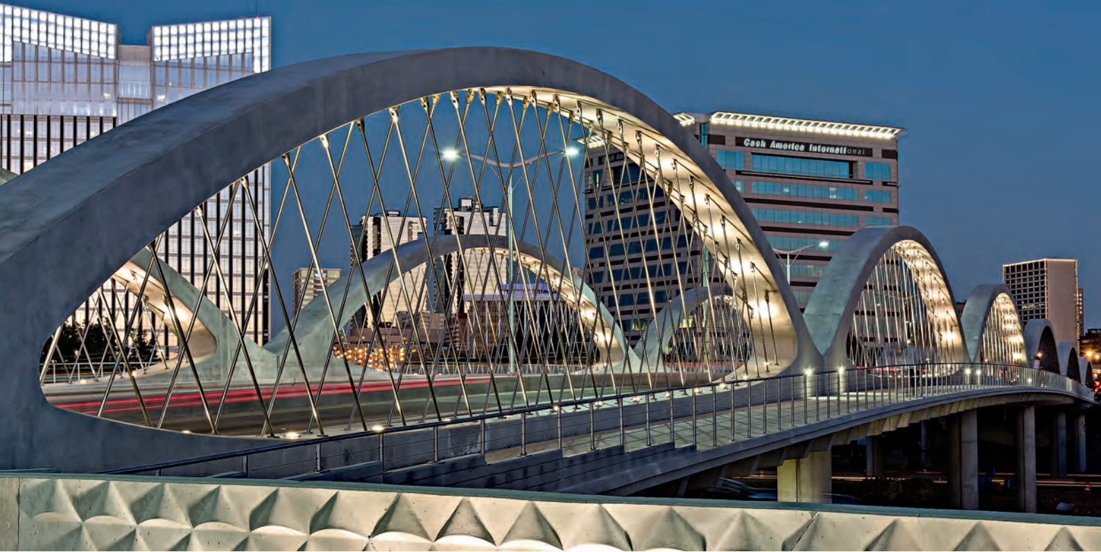
Light gleaming off the 2205 duplex stainless steel hanger bars adds the sculptural look of this beautiful bridge.

The key feature of a network arch bridge is its angled hangers. These hanger bars connect the 'tie', which holds the arch ends at the bottom of the arch together, to the top of the arch. The combination of the tie and hanger system creates a truss-like behavior where the hangers transmit loads from the deck through the tie and into the arch. In contrast to a traditional vertical hanger system, the angled bars reduce bending in the arch when vehicles and people pass over the bridge. This system is structurally highly efficient. Most network arches use steel box arches, whereas the West 7 th Street Bridge uses precast, prestressed concrete arches.