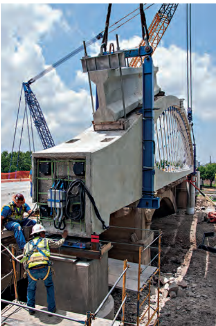
On-site placement of a bridge arch.

museums designed by some of the world’s most famous modern architects. It offers spectacular views of the river, downtown and the museum district. Lights within its graceful arches highlight the gleaming angled stainless steel bars. The sidewalk’s position, right next to the arches, encourages pedestrian