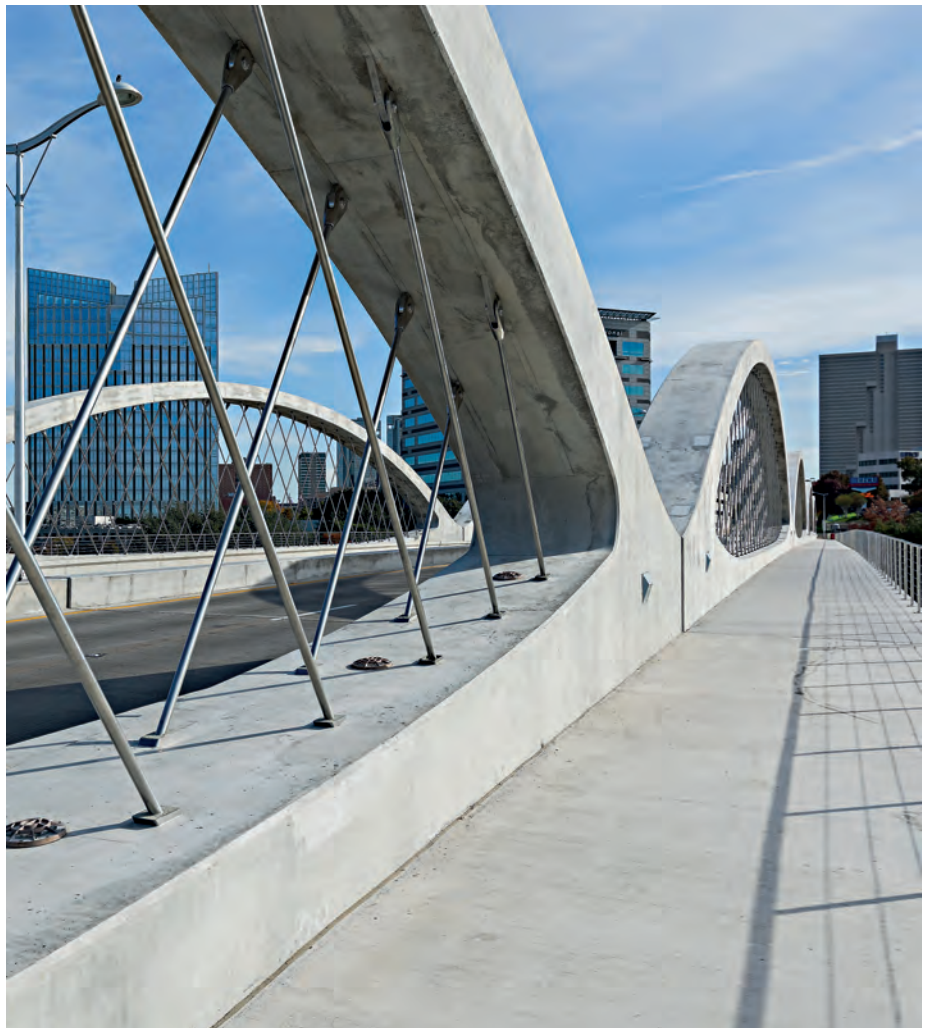
The West 7 th Street Bridge in Ft. Worth, Texas USA uses angled 2205 duplex stainless hanger bars in its structurally innovative precast concrete network arch design.

The 299-meter-long, multi-award winning, four-lane West 7 th Street bridge was completed in 2013. This vehicular bridge also provides a walkable gateway between the downtown area and