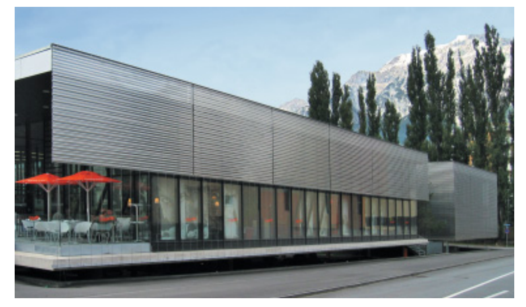
Glass panels, with and without stainless steel mesh, alternate in rhythmical fashion.

The store is designed as a light-permeable space. Daylight is brought into the interior to enhance the presentation of the goods.