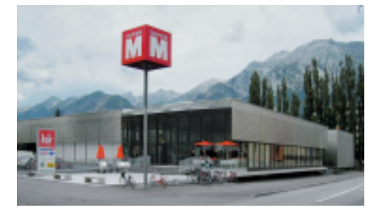
Client: M Preis Warenvertriebs GmbH, Völs, Austria Architect: Dominique Perrault, Paris, France Rolf Reichert, RPM-Architekten, Munich, Germany

The effectiveness of the stainless steel mesh as regards solar shading is clearly legible. This semi-transparent, openwork texture also adds interest and rhythm in the way the changing light plays on its surface.