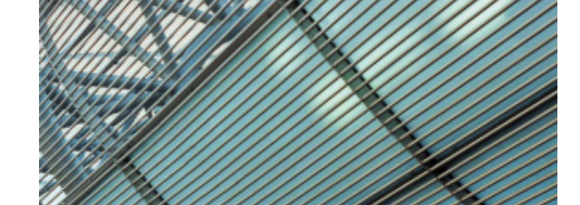
Client: FDG Flughafen Düsseldorf GmbH, Germany Architects: J.S.K. Architekten, Düsseldorf, Germany