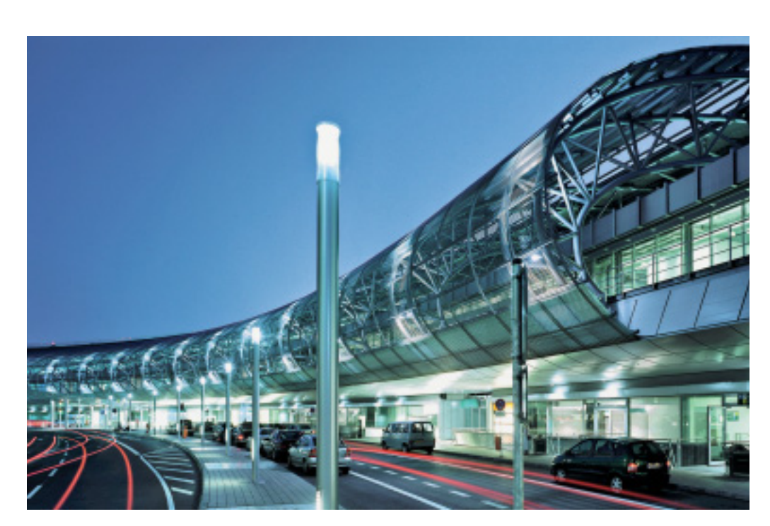
The girders of the hall roof arch elliptically around a 400-metre stretch of the tracks of the new SkyTrain. The outside of the steel and glass construction is clad with stainless steel tubes.

tubular encasement is clad on the outside with stainless steel tubes (grade: 1.4404) fixed horizontally.