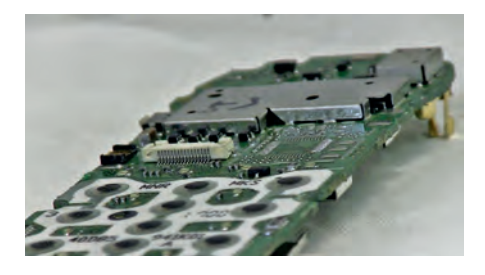
Electronic circuit board before treatment. © CNRS

One million phones seems like a large number, but it is actually quite modest considering that global smartphone sales for 2016 alone are estimated to be nearly 1.5 billion. Even so, Orléans University's moly-containing vats may be a first step towards a new technology to treat electronic waste. (Thierry Pierard)