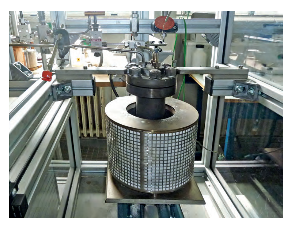
Prototype reactor for environmentally friendly electronic-waste treatment.

The project now operates experimental vats with capacities of 0.3 and 2 liters. A 10-liter vat designed to handle relatively small quantities of electronic scrap is scheduled to begin operating in 2020. This next development phase will employ a semi-continuous closed cycle that feeds batches of circuit boards to the reactor while maintaining supercritical conditions. Treatment times will range from 30 minutes to a few hours, depending upon the quantity of material contained in the batch. The gases produced by the reaction - mostly methane - will be recovered and fed back into the loop to reduce energy consumption and process cost. The commercial process envisioned by the team aims to handle the components of about 1 million phones annually.