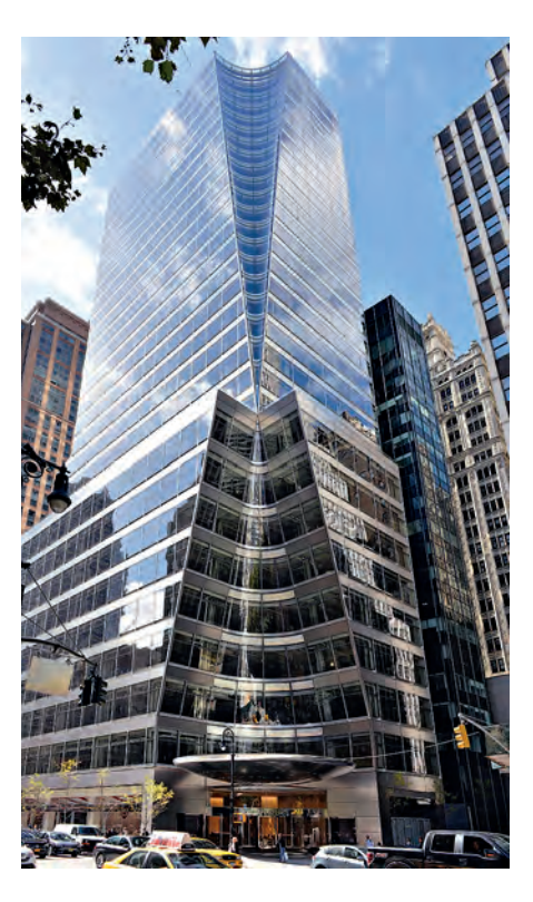
7 Bryant Park's elegant exterior features Type 316 stainless steel.

Type 316 stainless steel also welcomes visitors to Manhattan Island. It is most visible at Whitehall Ferry station, which was completed in 2005, and on the exterior of the newly-renovated Jacob K. Javits Convention Center. It is an obvious choice for other categories of buildings designed for longevity like the new David H. Koch Center for Cancer Care, museum entrances, municipal service and educational buildings. The new notable projects list is not exhaustive and there are many smaller and existing projects within the city that illustrate the durable beauty of molybdenum-containing stainless steel. (Catherine Houska)