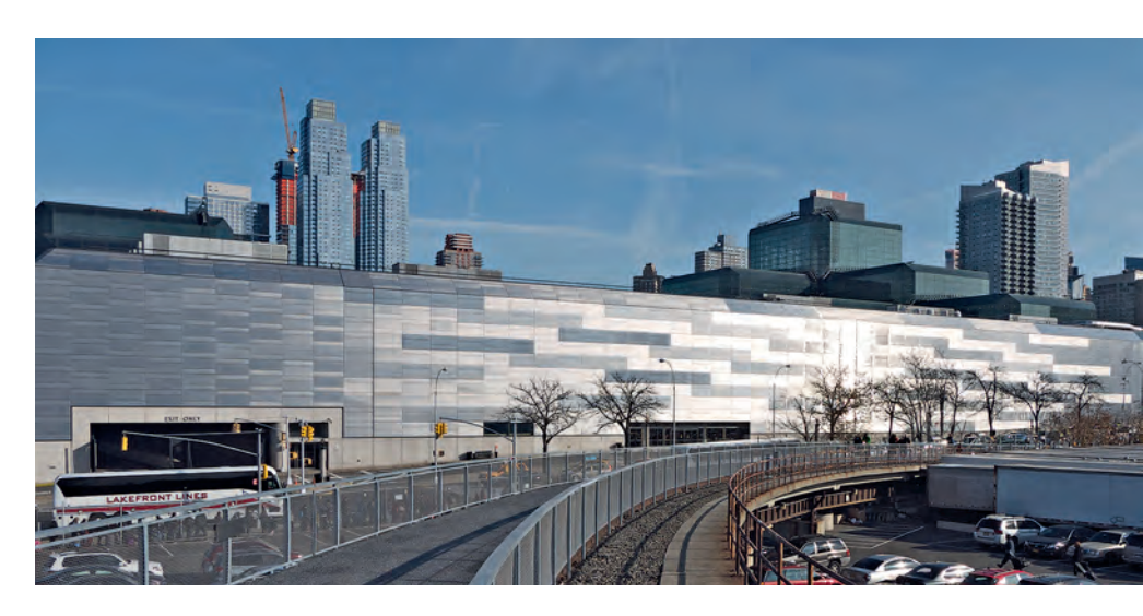
Three different Type 316 finishes add visual interest to Javitz Convention Center.

Some of the residential buildings use relatively small amounts of stainless steel as jewelry-like design accents. The Jahn-designed 50 West Street, which is nearing completion, uses Type 316L to accent remarkable curved glass panels. A mirror polished Anish Kapoor "mercury drop"-like sculpture will appear to support the new residential