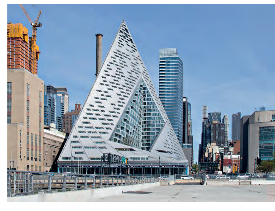
The innovative VIA 57 WEST was designed to be the world's most sustainable residential building.