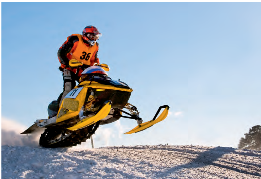
Bismuth vanadate pigments are used in the yellow paint of ski mobiles.

The worldwide annual market for all kinds of pigments is about 8 million tons with a value of nearly $20 billion. Molybdenum-containing pigments account for a small part of the six-million-ton inorganic pigment market. However, increasingly they play an important role in meeting the need for environmentally friendly pigments, and can be expected to occupy a greater percentage of the market in years to come. Molybdenum helps make our world greener in more ways than one! (Curtis Kovach)