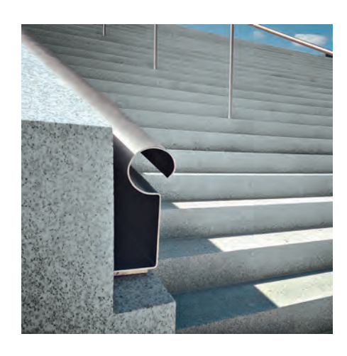
The custom made duplex handrails blend in with the granite.

Just days after the park opened to the public, Hurricane Sandy submerged the railings. They were undamaged and