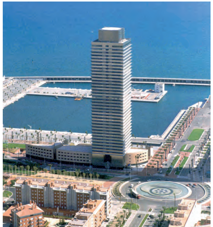
Figure A The Type 316 stainless steel clad Mapfre Office Tower is separated from the Mediterranean Sea by a park and marina. Despite the corrosive location, the appearance of the stainless steel is unchanged.

Barcelona is an important port city. Sea salt and high levels of air borne particulate from loading and unloading ships make the location corrosive. Occasional dust storms originating in the Saharan Desert add to the particulate levels. Locally produced Type 316 (UNS S31600, EN 1.4401, SUS 316) stainless steel and high-efficiency blue glass were used for the exterior.