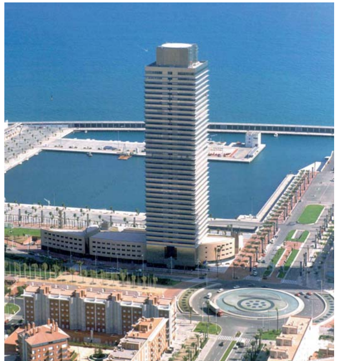
Figure A The Type 316 stainless steel clad Mapfre Office Tower is separated from the Mediterranean Sea by a park and marina. Despite the corrosive location, the appearance of the stainless steel is unchanged.

Barcelona is an important port city. Sea salt and high levels of air borne particulate from loading and unloading ships make the location corrosive. Occasional dust storms originating in the Saharan Desert add to the particulate levels. Locally produced Type 316 (UNS S31600, EN 1.4401, SUS 316) stainless steel and high-efficiency blue glass were used for the exterior.