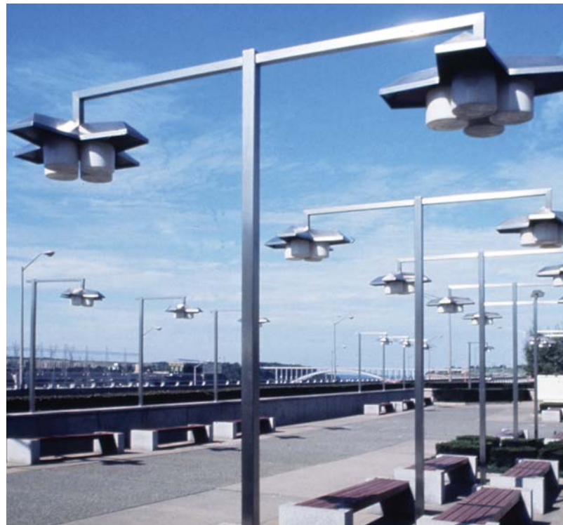
Figure A Boldly exposed Type 316 stainless steel light poles with a smooth finish provide good performance in most coastal applications.

The Type 316 sample has a few superficial corrosion spots that could easily be removed by cleaning but it still looks attractive. The Type 304 sample is badly stained. Like the two light poles, these samples illustrate Type 316's superior resistance to staining and corrosion in a coastal location.