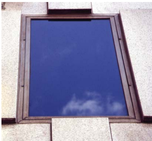
Figure C This Type 304 stainless steel window frame has not been cleaned in five years. Type 304 that is exposed to deicing salt must be cleaned regularly to remove corrosive deposits. Even with that precaution, some staining may occur between cleanings.

The Type 304 (UNS S30400, EN 1.4301, SUS 304) stainless steel window frame is a few blocks away from the museum on the same busy road ( Figure C ). Both the window frame and the Weisman panel shown in Figure B have similar deicing salt exposure, are about the same distance from the road, and have smooth finishes.