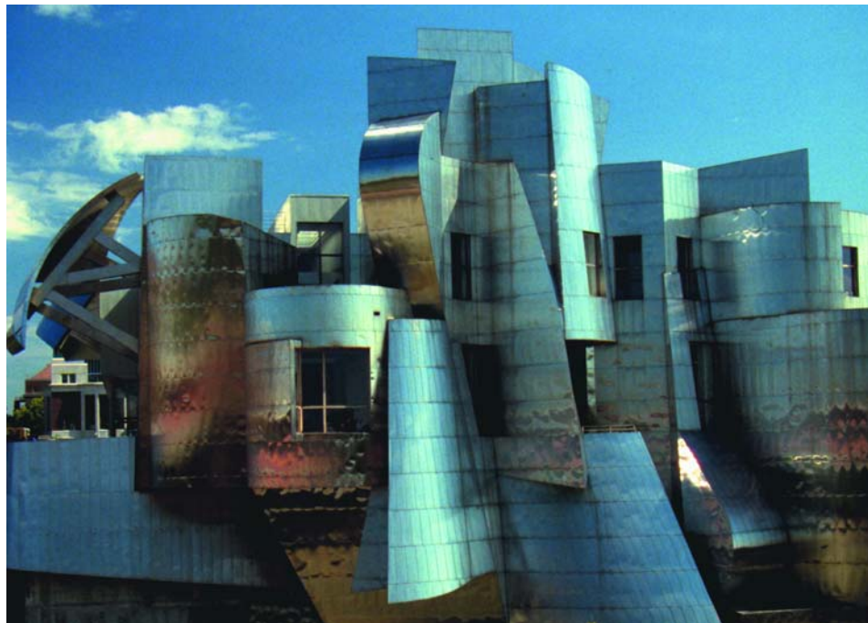
Figure A (above) Type 316 stainless steel with a smooth surface finish and a design that encourages rain cleaning was the right choice for the Weisman Art Museum. Although it is beside a busy road where deicing salt is used, there is no corrosion. The color of the building changes constantly as it reflects the surrounding environment.

The closest panels are about 4.6 meter (15 feet) from the road. A smooth No. 4 finish was specified with an average surface roughness of R_a 0.5 \mu\text{m} or 20 \mu\text{in} . During design, it was assumed that there would be little or no manual cleaning of the building. The building is cleaned about every five years to remove dirt accumulation. The design, smooth surface finish, and vertical finish grain orientation make it easy for natural rain-washing to remove salt.